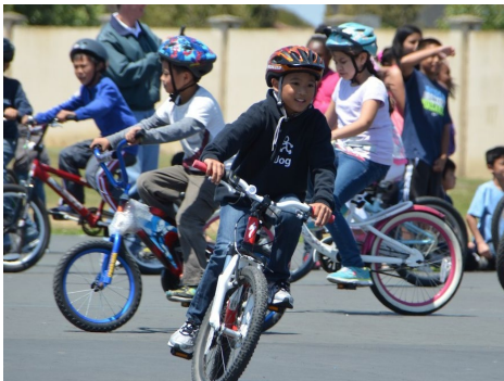
Safe Routes To Schools