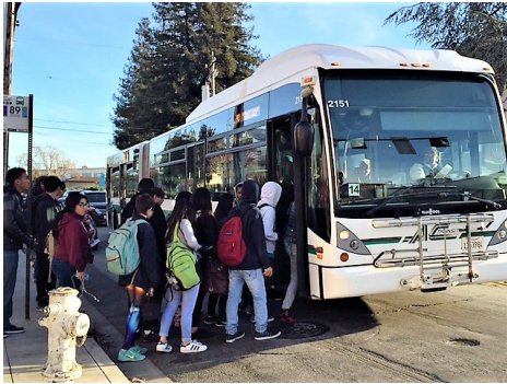
Affordable Student Transit Pass Program