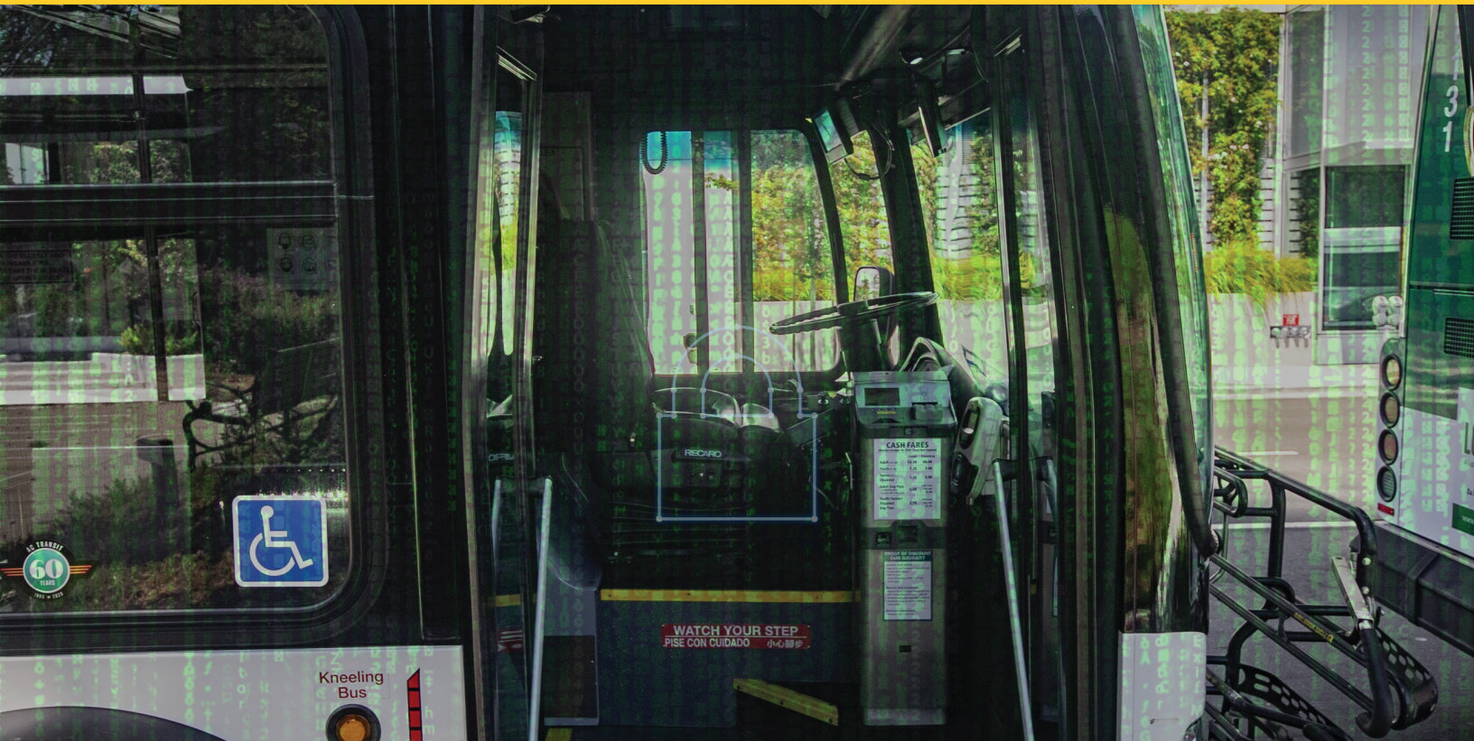
AC Transit's top tier "Cy-BASE" score demonstrates the resilience of the District's IT systems in defending against cyber threats.

For AC Transit riders and the communities we serve, the nearly 100% Cy-BASE cybersecurity assessment translates to stronger protection of our internally engineered innovations like mobile payment, offering greater confidence in uninterrupted service, even in the event of cyber threats.