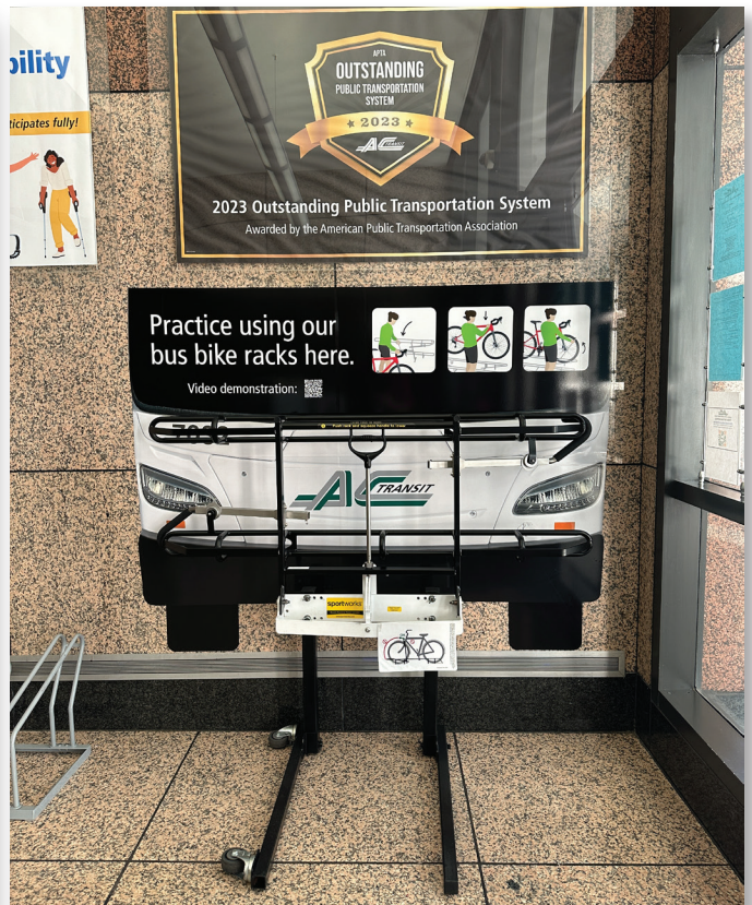
The demonstration model features an info graphic, which allows riders to see the functionality, design, and ease of use of the folding bike rack.

Additionally, we have begun upgrading and filling the trophy case. The upgrades include new LED interior lights and branding for the District on the front of the case. This display now features three shelves of awards and trophies, along with one shelf dedicated to historical memorabilia, including a digital photo frame showcasing archival images of our service history.