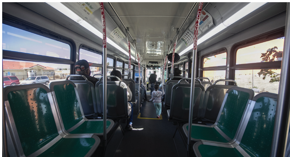
The Realign plan is equity focused and introduces new bus lines, eliminates underperforming routes, and adjust the frequency of routes.

Throughout Realign, staff has worked closely with our labor partner, ATU Local 192, to design and plan various adjustments, including additional runtimes, frequency changes, stop modifications, and all-new layovers, all focused on identifying the optimal time to launch Realign.