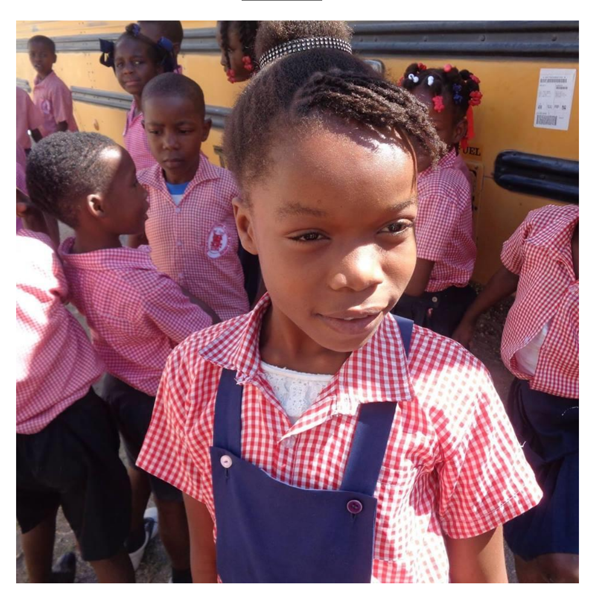
"If we are to reach real peace in the world...We shall have to begin with the children". --Mahondas Gundhi