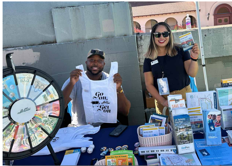
AC Transit and UC Berkeley Parking & Transportation teamed up during Caltopia to share public transit information with the masses.

For 25 years, UC Berkeley students have accessed themselves a fee to include EasyPass, or ClassPass, which provides unlimited bus service on all AC Transit lines as long as they are enrolled. This benefit remains popular and has contributed to robust ridership among students, leading to lifelong support for public transit.