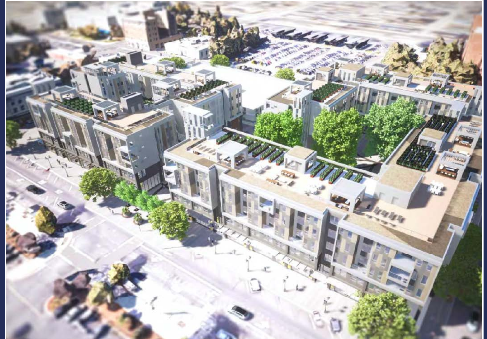
12 th and Macdonald Project