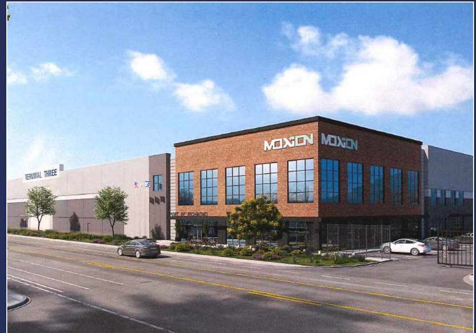
Portside Commerce Center (Moxion)