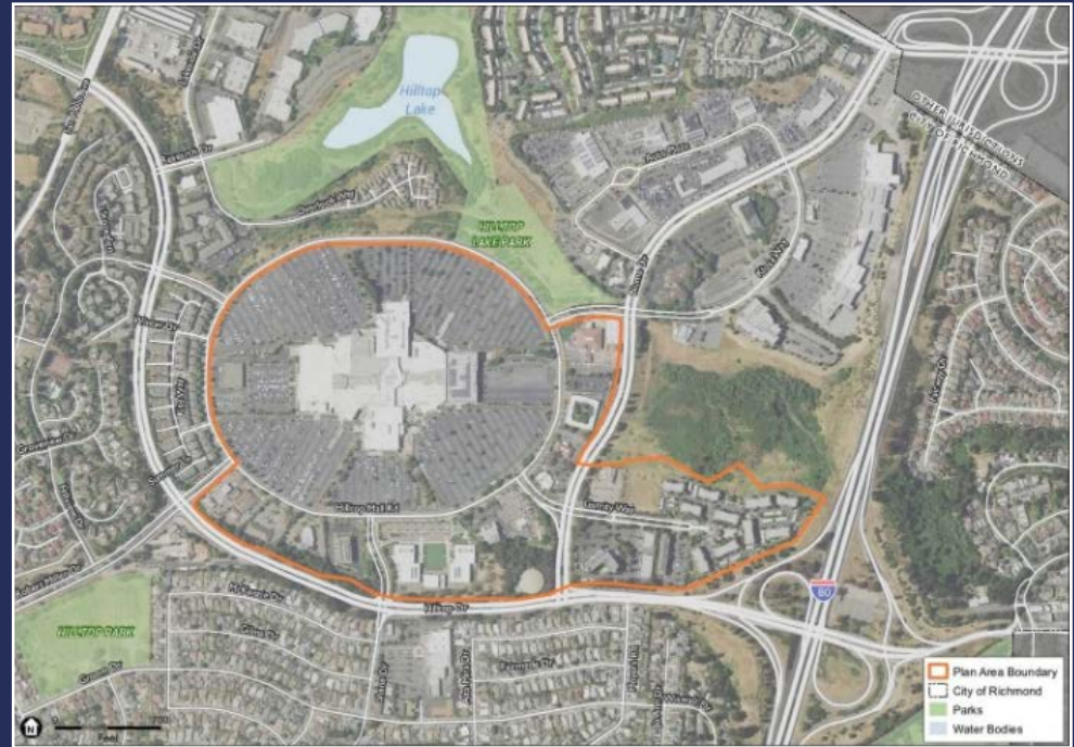
Specific Plan Area

Please visit hilltophorizon.com for more information and to sign-up for notifications.