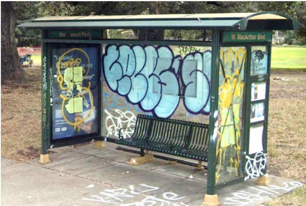
Oakland Shelters (Previously CCO)