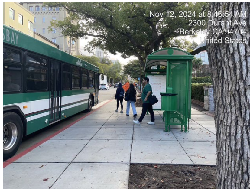
Durant Quick Build Transit Shelters