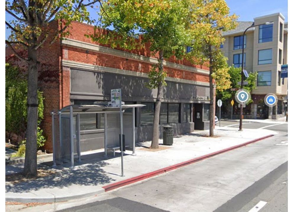
City's grant funded bus stop improvements