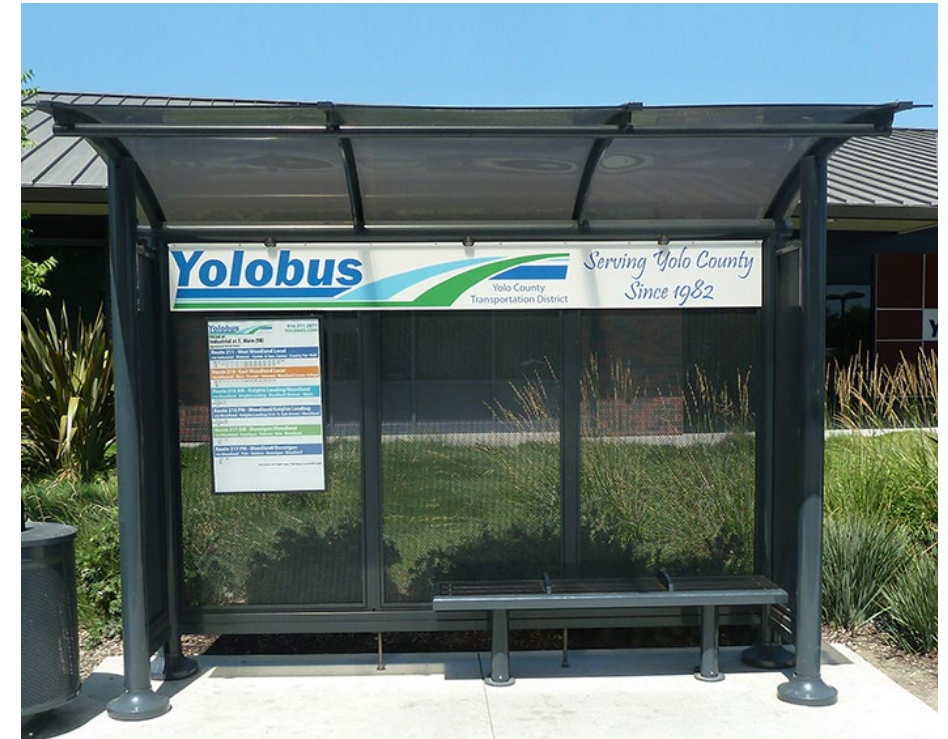
Example of Tolar Sunset Series Shelter. Available to AC Transit through CalACT

** Estimates based on 276 shelters, could change depending on field conditions