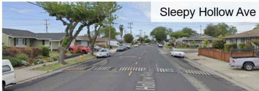
Sleepy Hollow Ave

Arterials & Collectors inside commercial areas (Non-downtown) or near schools