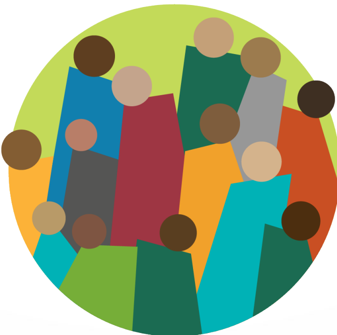
Driven by Equity