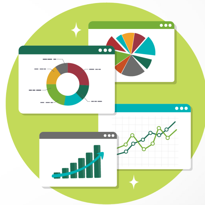
Backed by Data