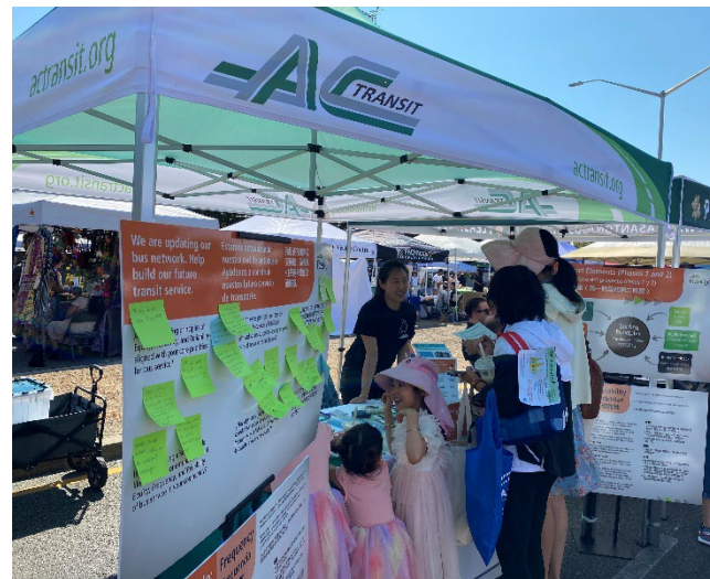
Realign pop-up at Fremont Festival of the Arts.