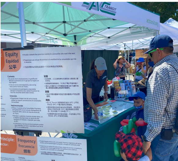
Realign pop-up at Laurel Street Fair in Oakland.