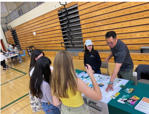
Albany High School Orientation

Numbers denoted in parenthesis represent the number of tabling events at that school site.