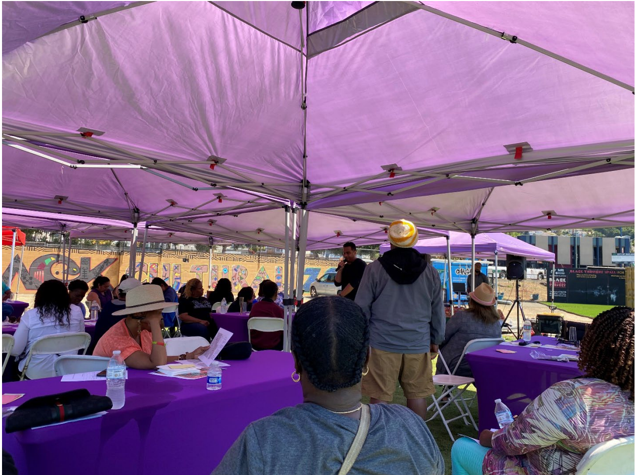
Participants engaging at the Black Cultural Zone Breakfast meeting at Liberation Park.