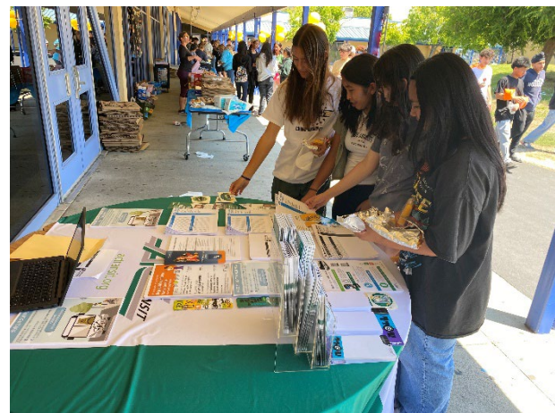
Newark Memorial High School Orientation