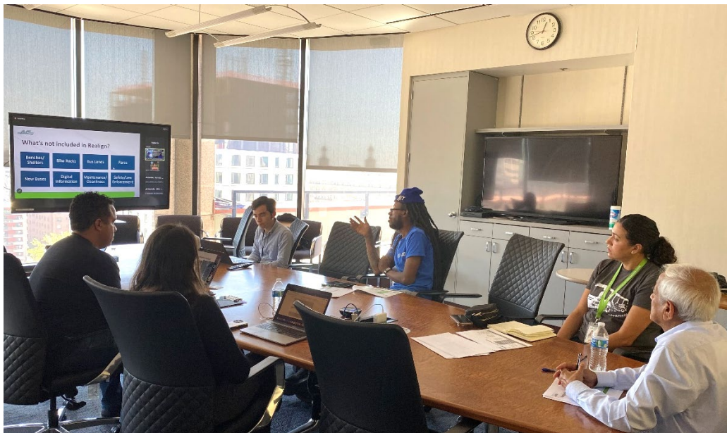
LEAG Meeting #1 (Hybrid Meeting)