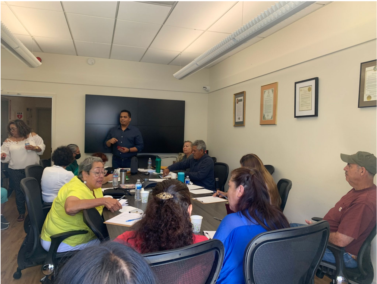
Participants engaging at CRIL focus group.

This focus group engaged with communities from Wards 2 and 3, primarily capturing residents of East Oakland. An estimated 44 community members participated. In the event with Black Cultural Zone, a significant portion of time was spent listening to concerns about bus service in East Oakland, particularly as it relates to Tempo, leaving limited time to dive into the guiding principles discussion.