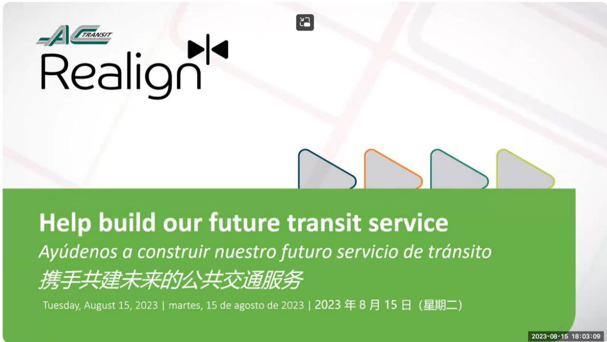
Realign Community Workshop No. 1

The August 15, 2023, District-wide community workshop is available at actransit.org/realign