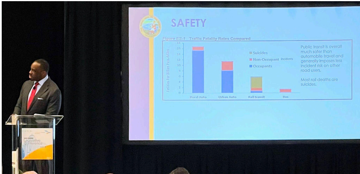
Toks Omishakin, Secretary of the California State Transportation Agency (CALSTA) presenting on transit safety