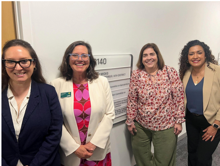
Preparing to meet with Assemblymember Wicks