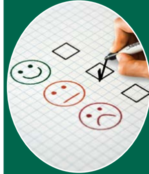
Data Quality & Culture Survey 2022

Enable data-driven decision-making, utilizing accurate and reliable data from an easy-to-access enterprise platform