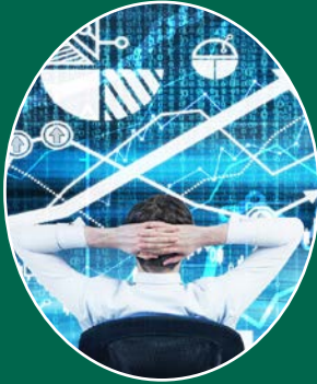
Data as a Service Portal