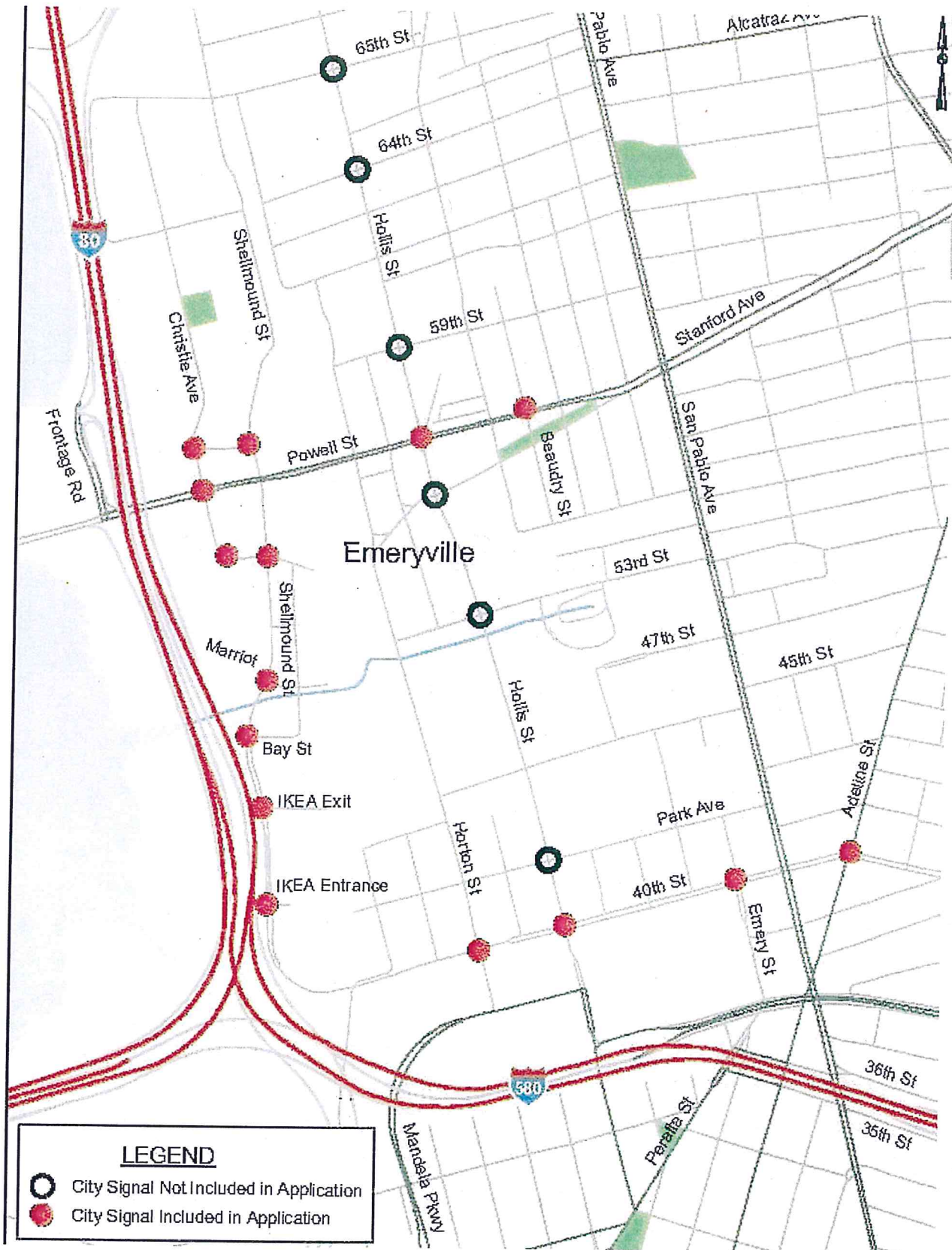
Figure 1 Project Area